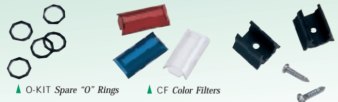
MP Mounting Plate