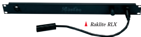
▶ Raklite RLX

The LITTLITE® HIGH INTENSITY RAKLITE comes complete with your choice of one or two 12" goosenecks, with bright 5 watt bulbs, dimmer rheostat, 6' cord and transformer. When mounted at the top your rack, the Littlite® provides illumination for an entire rack of lighting or audio equipment. Littlite's flexibility allows you to adjust illumination for patching or general rack service. The gooseneck light is recessed into a sturdy black metal E.I.A. standard 19" wide x 1.75" high rack panel. It is available in 12V, 110V, and 240 volt versions.