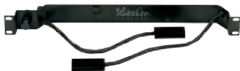
▶ Raklite RL-10-D

The LITTLITE® RLX™ RAKLITE is a sleek black single space rack panel (1.75") equipped with two 3-pin XLR connectors ready to receive one or two X or XR detachable Littlites. The convenient dimmer allows you to adjust the brightness of the Littlite® to the desired intensity. The flexible gooseneck allows you to direct the light exactly as needed: at turntables, CD changers, audio or lighting racks. Available in 12V, 110V and 240 volt versions. (Goosenecks not included.)