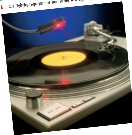
▲ ...For DJs and audiophiles