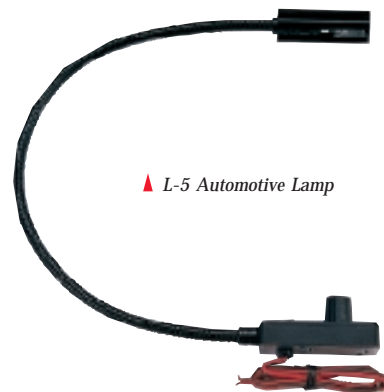
▶ L-5 Automotive Lamp

The L-6 SERIES is portable. The gooseneck is permanently attached at one end of the chassis. The two foot cord with a cigarette plug exits from the opposite end.