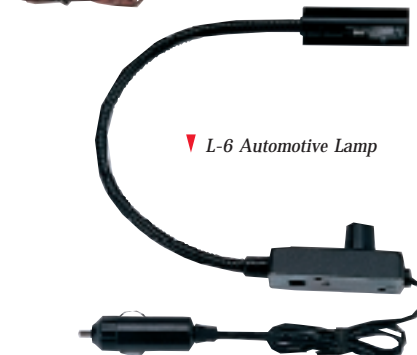
▶ L-6 Automotive Lamp