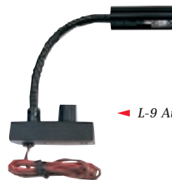
▶ L-9 Automotive Lamp